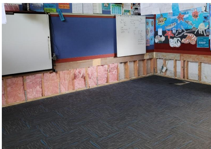
Room 15 (now in Room 12)

We have seen some quick work to open up the walls of the flooded classrooms and get them dry before next steps are decided on for these spaces. We continue to work with the Ministry of Education to find solutions for the flooding issue that has, caused damage over the years at our school.