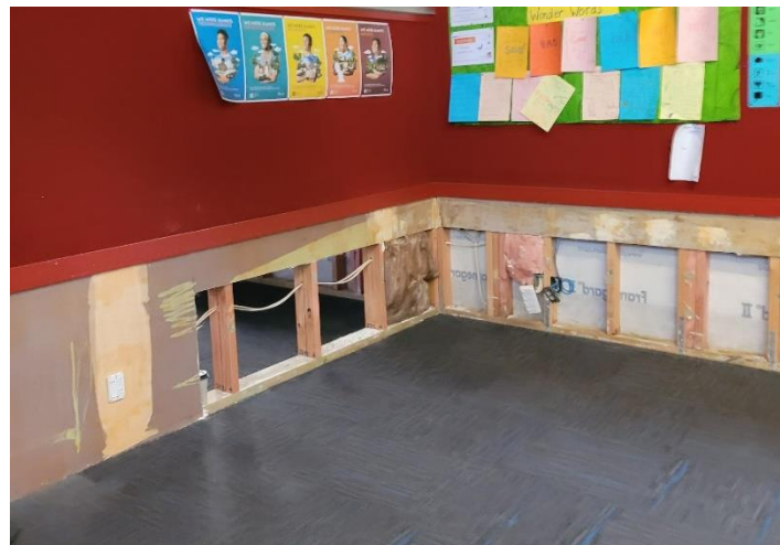
Room 14 (now in Room 10)