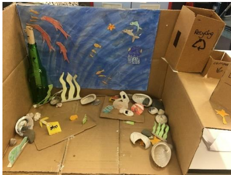
Ocean Environment Game