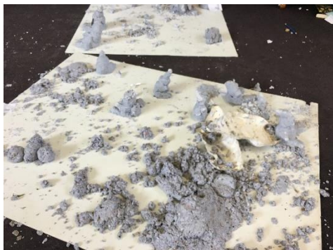
Seaweed Gnome Production

The tamariki in Room 1213 have been continuing with their learning about Rimurimu (seaweed) and next Wednesday are having a seaweed party for their whanau in the school library where they will be sharing their learning. The work they have been doing is very impressive and this will be a wonderful opportunity to celebrate this together.