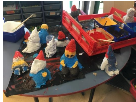
Seaweed Gnome Painting