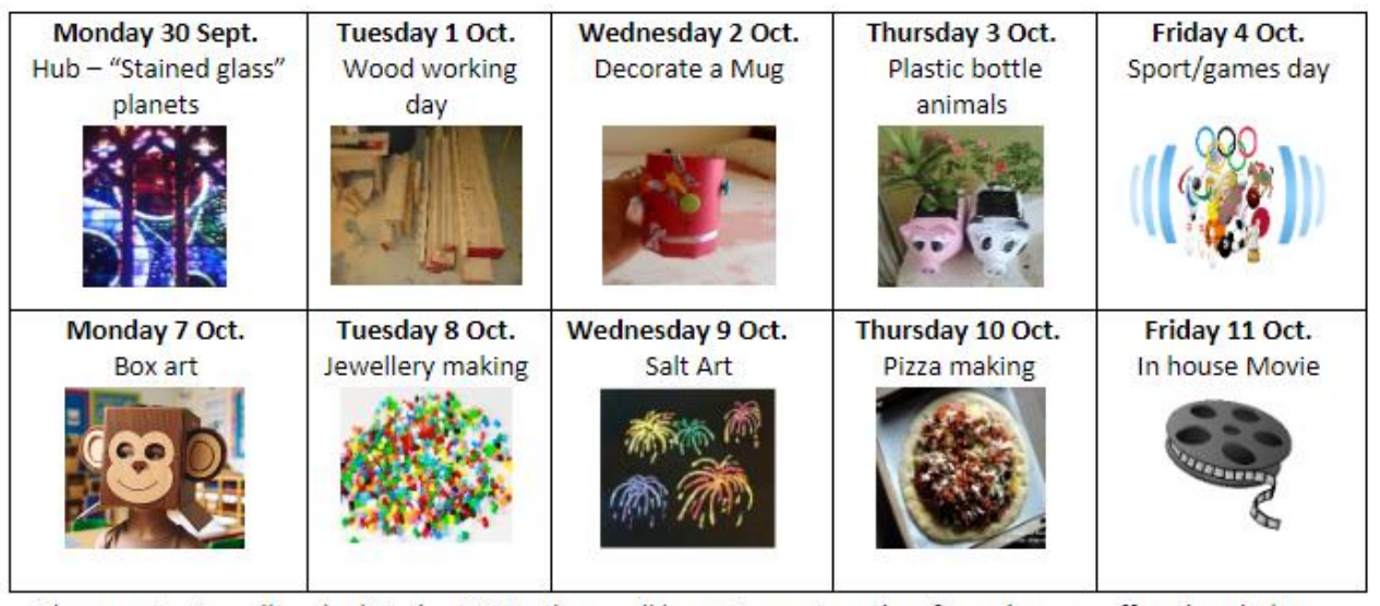
Please note: As well as the listed activities there will be various arts and crafts and games offered each day, as well as cooking activities on some days.

Once we have your request to enrol form, you are liable for the charges whether your child attends or not, unless notification of cancellation is received by Thursday 26 September 2024.