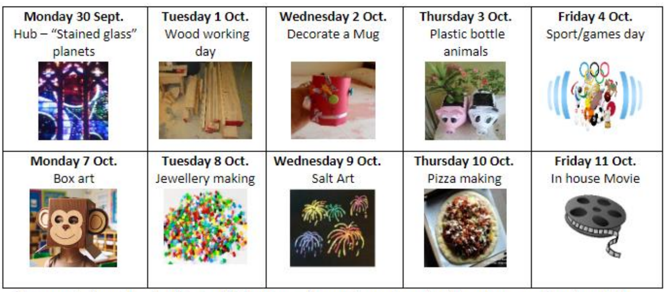
Please note: As well as the listed activities there will be various arts and crafts and games offered each day, as well as cooking activities on some days.

Once we have your request to enrol form, you are liable for the charges whether your child attends or not, unless notification of cancellation is received by Thursday 26 September 2024.